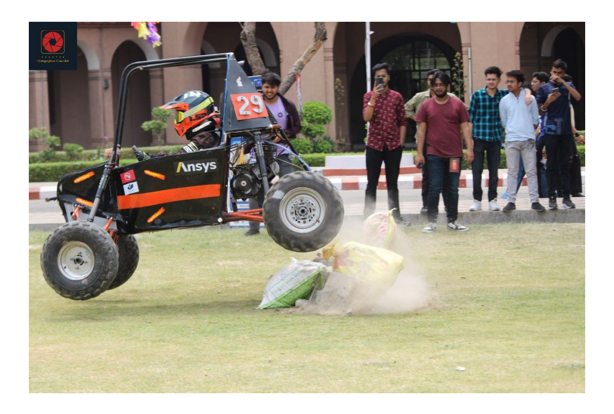
Vega (Student society of Mechanical Engg.) showcasing their car and performing stunts

The first day of the fest had a list of exciting events and mainly was focused on the technical side. The events include Lazer Strike, and Robowars along with some cultural events like Street Plays and Flashmob marked the day with extreme exuberance.