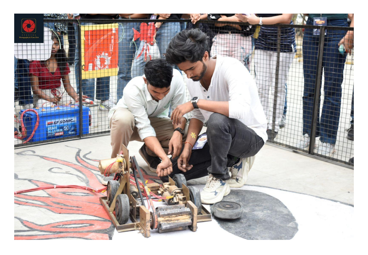
Students were participating in their most famous event "Robowars"

The third day of the Zealicon 2023 was also celebrated by the staff and students as Ethnic Day, on which each of them twinkled with exquisite traditional attires which reflected their dignity and regard for their culture. In addition to this, the events and competitions that took place were Face painting, group singing, quiz Up, Imagica, and many more.